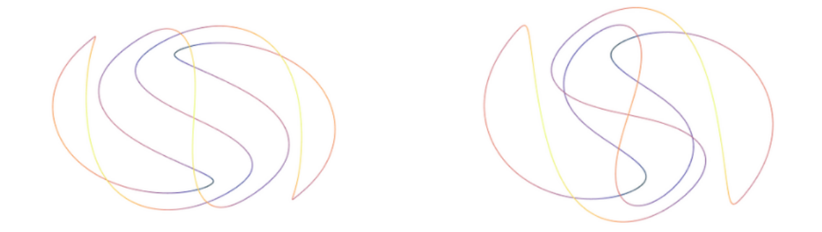
Figure 1. I.A.2 butterfly II (left) and I.A.1 butterfly I (right). Lighter colours denote higher elevation (when viewed in 3D after Step IV).

Some orbits are easily determinable, such as I.A.2 butterfly II, while others are more difficult, such as I.A.1 butterfly I. Both trajectories are shown in Figure 1. Figure 2 shows how a curve can be simplified using Reidemeister moves.